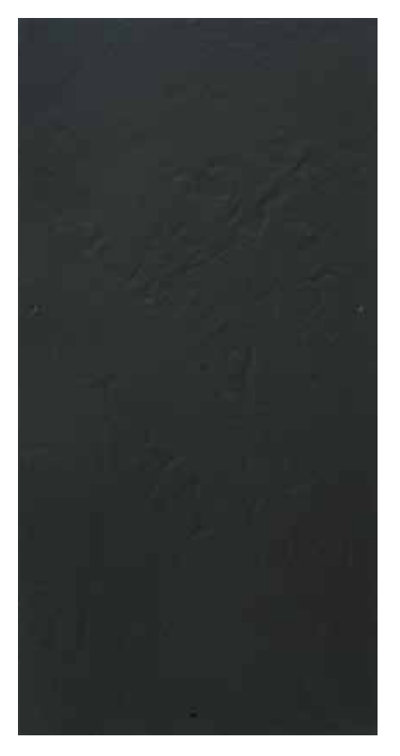
Blue / Black